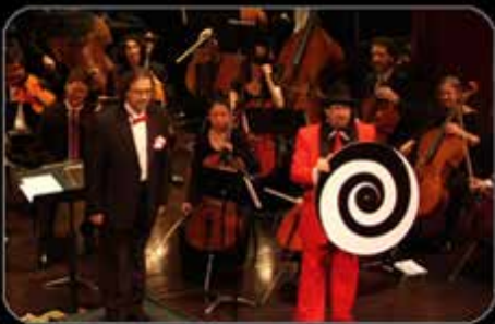
Magic with the Symphony