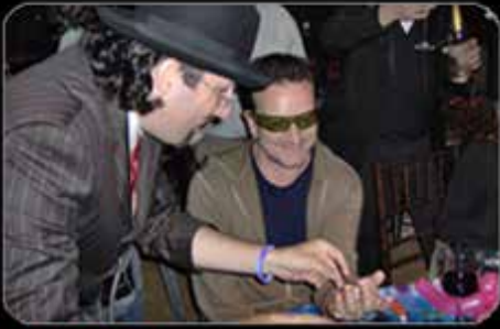
Bono - U2