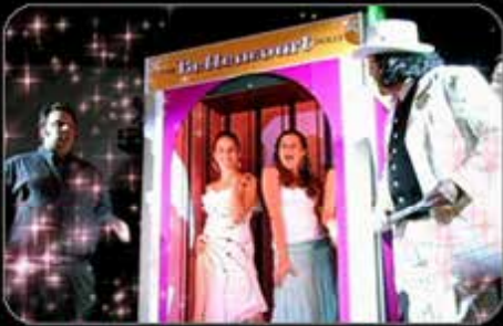
MTV's Super Sweet 16