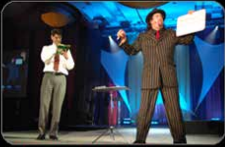
Adventist Health Care